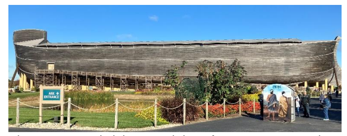
The Tri-Par Travel Club enjoyed the Ark Encounter in October.

Dec. 1-6, 2025 – Bus trip to Nashville Country Christmas – 5 nights lodging, 8 meals, 2 great shows (Grand Ole Opry & Nashville Nightlife Dinner Theater), guided tours of Nashville & Belle Meade Historic Site & Winery and admission to Country Music Hall of Fame & Museum and Admission to Behind the Scenes Tour.