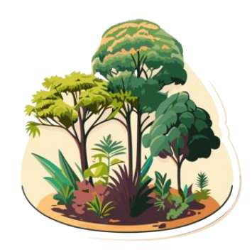
1881 INNISBROOK Your yard looks great!