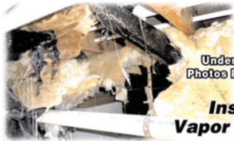
Underhome Photos Provided

Insulation Under Your Home Falling Down? Holes and Tears in Your Vapor /Moisture Barrier?