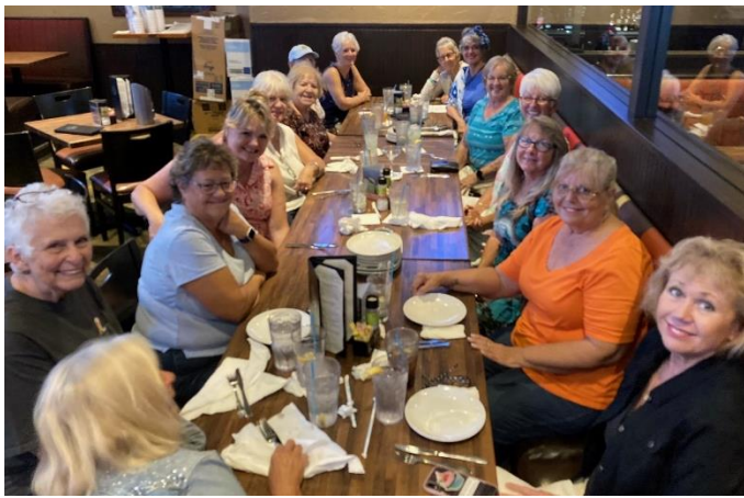
Tri-Par Estates Travel Club enjoying a shopping spree and lunch at Gecko's on September 26.